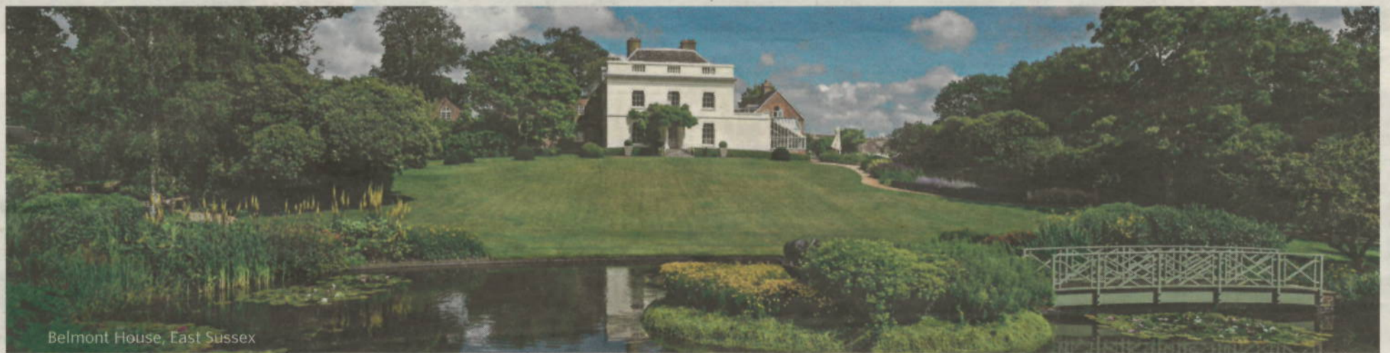
Belmont House, East Sussex